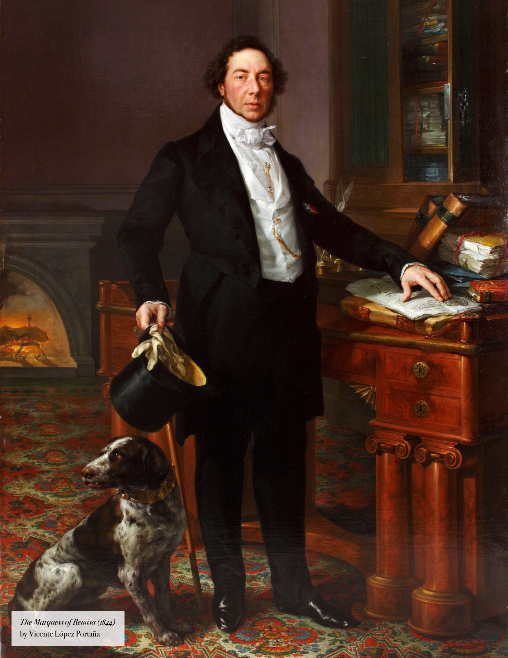
The Marquess of Remisa (1844) by Vicente López Portaña