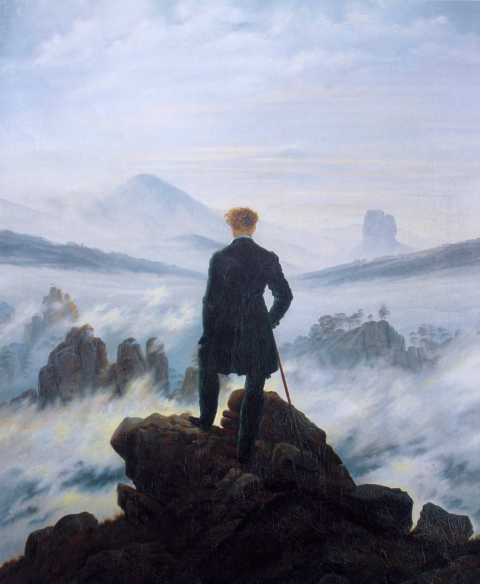
Wanderer Above the Mist by Caspar David Friedrich (1818)